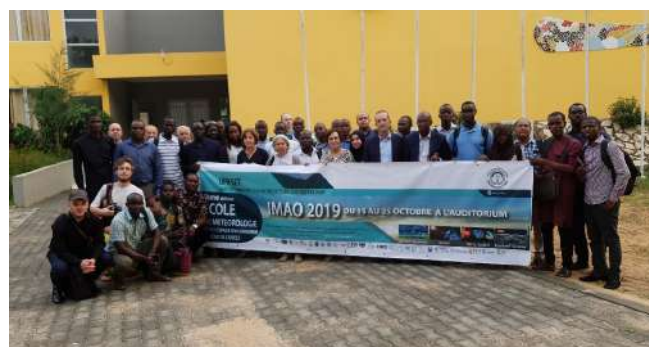
Figure 1. Group Photo from IMAO Workshop.

T he IMAO 2019 Space Weather School aimed to strengthen the capacities of young researchers, Master 2 students and PhD students from the Maghreb and West Africa in all the scientific disciplines concerned by 'Space Weather'.