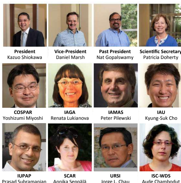
Figure 1. The 2019-2022 SCOSTEP Bureau.