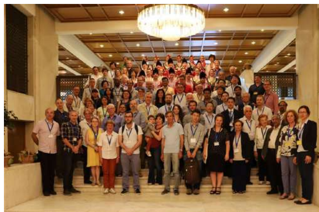
Figure 1. Group Photo of Participants.