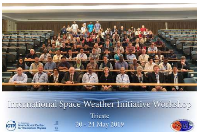
Figure 1. Group Photo of Participants.

ISWI, established in 2009, has proved to provide a framework for collaboration between teams of scientists, serving as an example of remarkable international work in instrument operation, data collection, analysis and publication of scientific results. ISWI has established a platform for bottom-up approach in order to produce space weather literate communities, particularly developing nations, and to work together as a network sharing ideas, information and data, and to create joint projects.