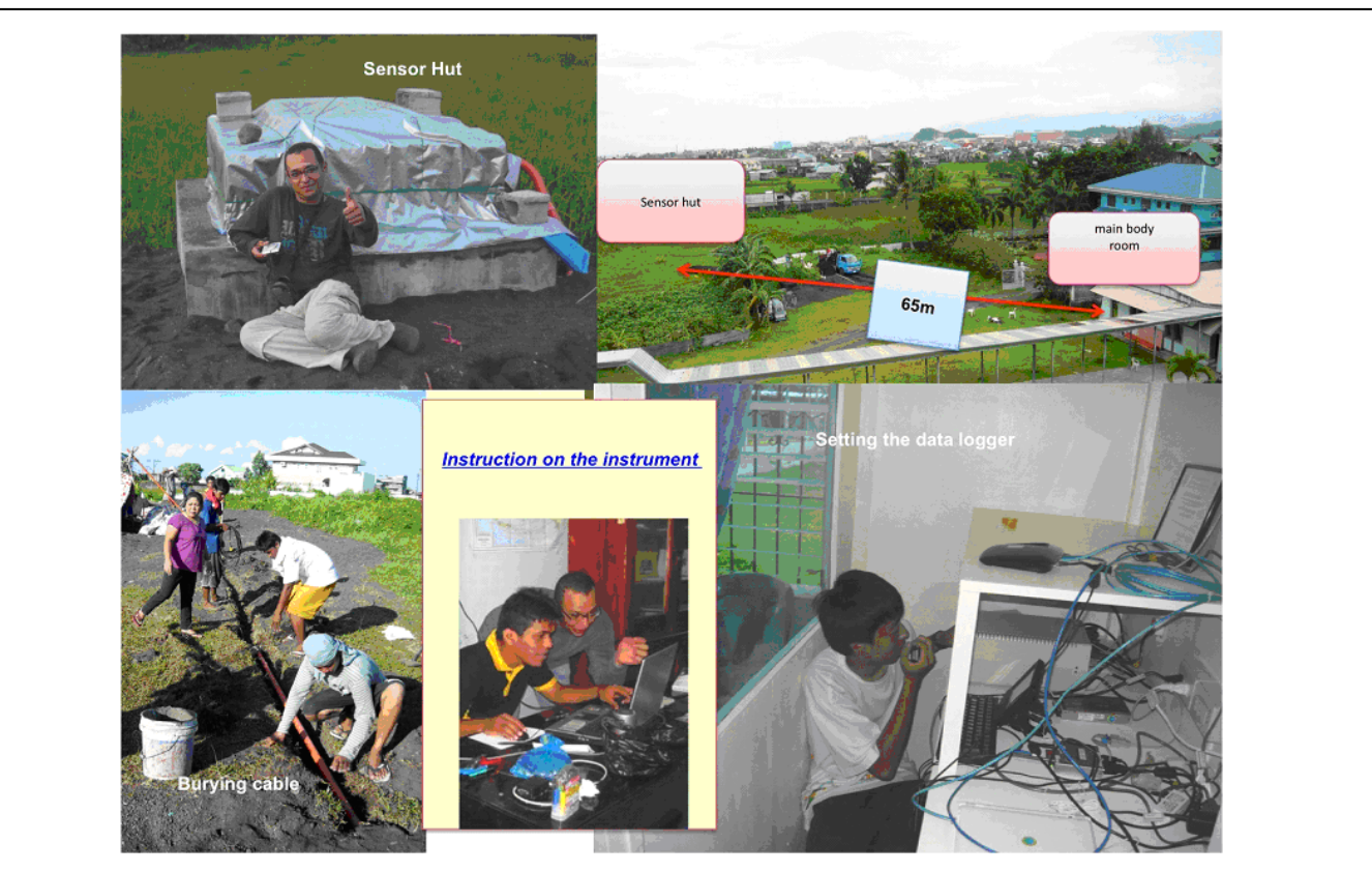
Fig. 1. MAGDAS Installation in the Philippines.

the host understands the importance of maintaining data collection instruments on a long-term basis.