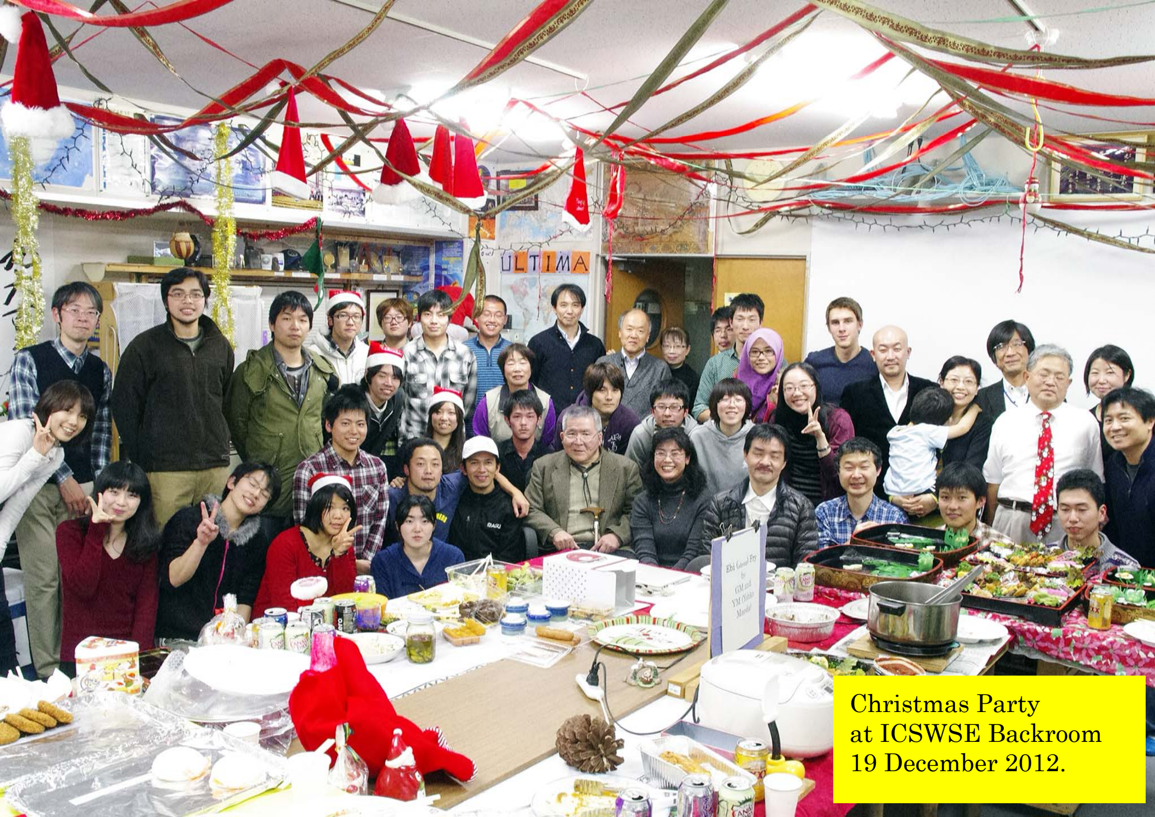
Christmas Party at ICSWSE Backroom 19 December 2012.