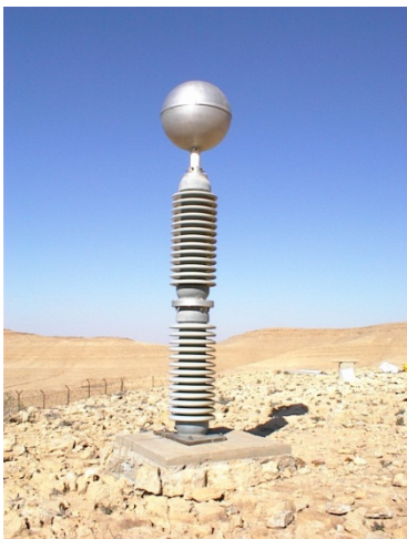
ELF vertical electric-field ball antenna located at Mitzpe Ramon, Israel

Our VLF stations in Israel have been used over the past year to study the narrowband (NB) signals transmitted by navy communication transmitters across Europe, and detected by our receivers in Israel. Since the power, frequency and location of the transmitters are constant in time, the variability in the observed signals is related to the ionospheric parameters along the great circle path, whether due to day-night differences, solar storms, sprites above thunderstorms, or changes in the D-region reflection height. In the last year we have been looking at the link between NB amplitudes and upper atmospheric temperatures. While the lower troposphere has been warming in the last decades, the upper atmosphere has been cooling much faster. We are investigating how the upper atmospheric cooling may impact the VLF NB signals detected at our stations in Israel. Can VLF observations be used to track temperature changes in the upper atmosphere?