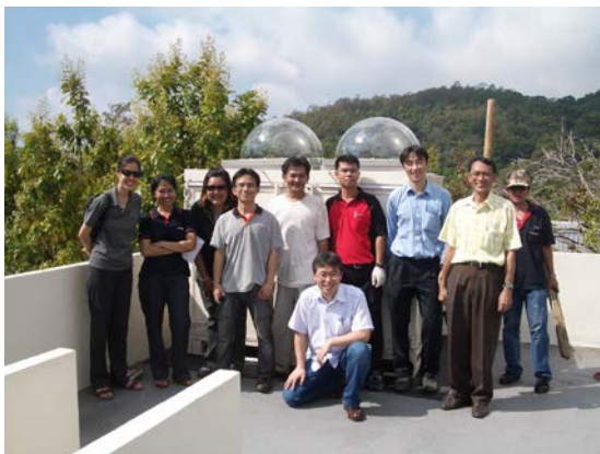
Figure 2. A photo of OMTIs installation at Thailand.

is invisible weak light emitted from the upper atmosphere. Several airglow emission layers exist in the upper atmosphere, for example, emission from oxygen atom at a wavelength of 557.7 nm at 90-100 km, infrared emission from hydroxyl (OH) at 80-90 km, and 630.0-nm emission from oxygen at 200-300 km, as schematically shown in Figure 1. By changing the filters of the measurement wavelengths, we observe dynamics of the mesosphere, thermosphere, and ionosphere separately. The upper atmosphere is the region where most of the artificial satellites and space stations exist. Thus the measurements of OMTIs contribute to the space use by human beings through understanding the “geospace” environment.