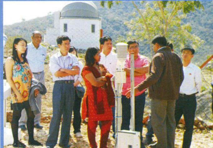
At USO Udaipur

Note: Those who are applying for TCS fellowship shall also include a copy of the duly completed form submitted to the Embassy/High Commission of India in their country.