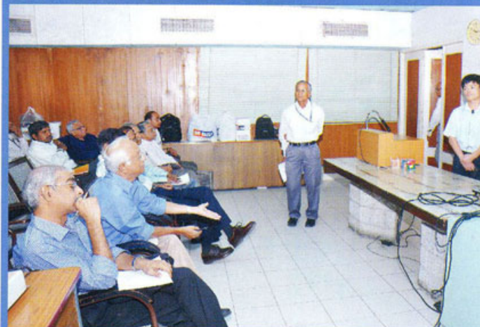
Pilot project viva