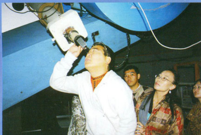
Infra-red Observatory, Mt. Abu