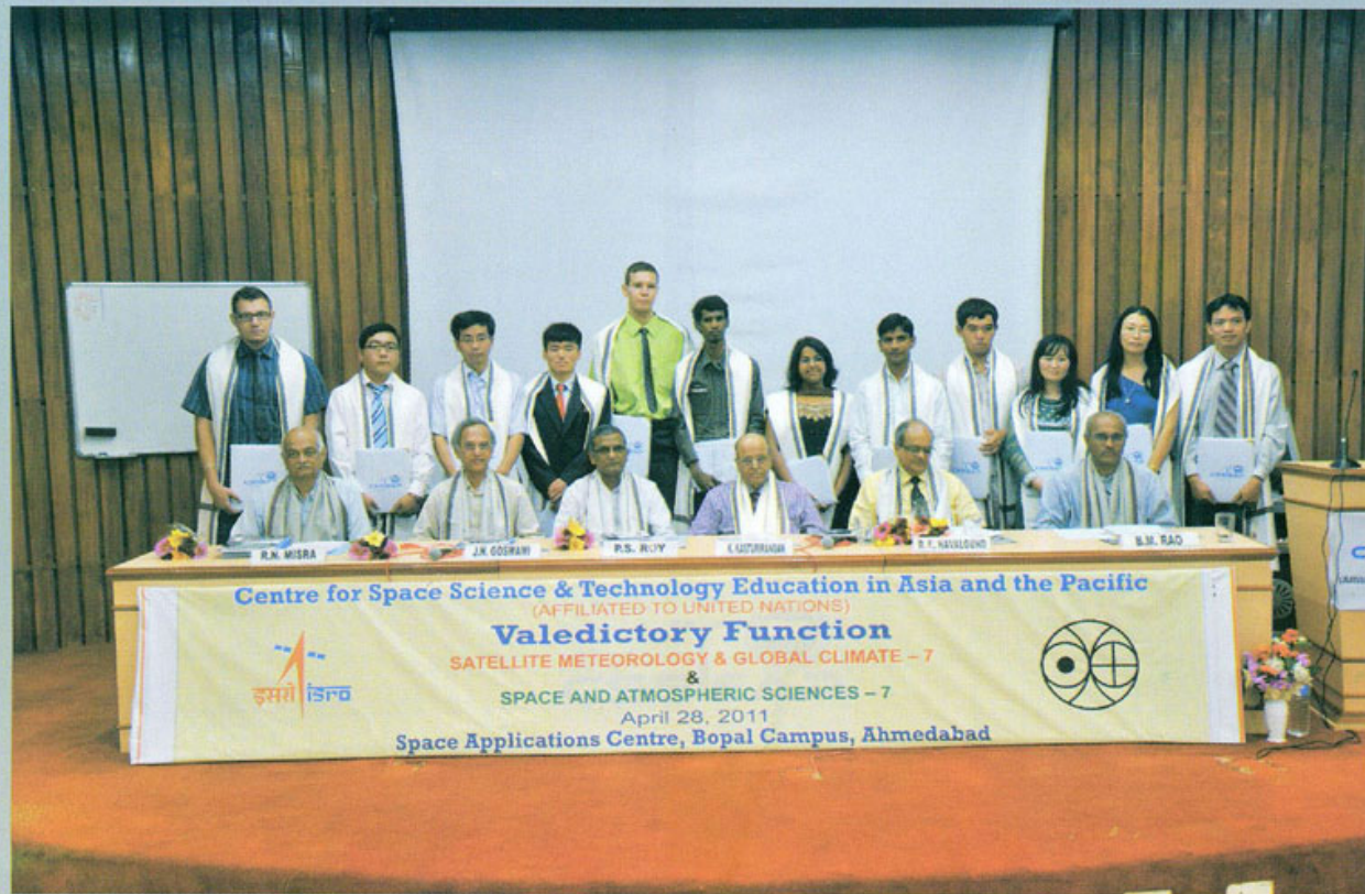
Valedictory Function of Seventh Post Graduate Course in Space and Atmospheric Science (2010-11)