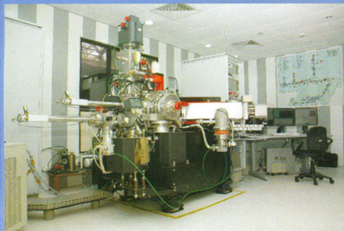
Nano SIMS Laboratory