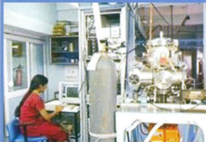
Space Photochemistry Lab