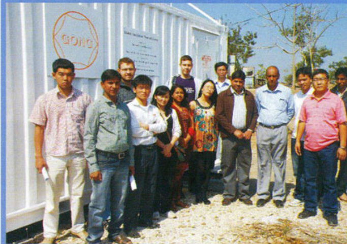
At Gong USO Udaipur

The phase I of the Space and Atmospheric Science Course, which is of nine month duration is organized in two semesters of 20 & 19 weeks each. This has been done to conform to pattern followed by Andhra University Visakhapatnam. There are four theory papers