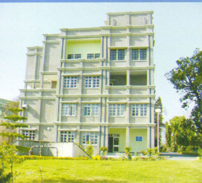
CSSTEAP Headquarters at Dehradun

The Centre has been imparting education and training, helping participants in developing research skills through its Master Degree, Post Graduate and Certificate programs. This is achieved through rigorous class-room (theory and hands on exercises), group discussions, field campaigns and pilot projects in the field of space science and technology. These programs aim at capacity building for participating countries, in designing and implementing space-based research and application programs. The Centre also fosters continuing education to its alumni.