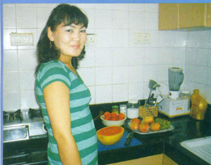
In the hostel kitchenette

alongwith six laboratory experiments in the first semester, and two theory papers, six more laboratory experiments and pilot project in the second semester. Introductory lectures on topics covering all the branches of space science and technology are taken in the beginning of the course for about one or two weeks. These topics together form common module.