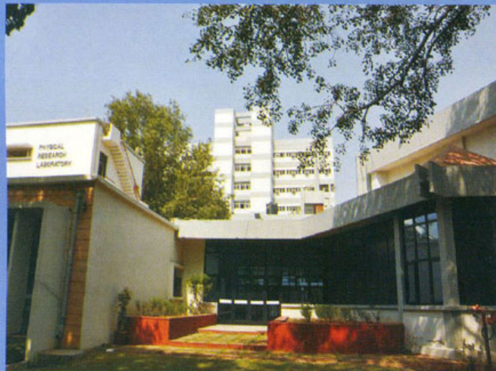
PRL main Campus

Physical Research Laboratory (PRL), founded in 1947 by Dr. Vikram Sarabhai, is a premier scientific institution under the Department of Space Government of India. As is very well depicted in its logo, PRL research encompasses the earth, the sun immersed in the fields and radiations reaching from and to infinity, all that man's curiosity and intellect can reveal. The research activities are multi-dimensional and cover Astronomy and Astrophysics, Solar Physics, Planetary Sciences and Exploration, Geosciences, Space and Atmospheric Sciences and Theoretical Physics. PRL has four campuses –the main campus is at Navarangpura, Ahmedabad and the others are at Thaltej, Ahmedabad, the infra – red observatory at Gurushikhar, Mount Abu, and the Udaipur Solar Observatory at Udaipur. PRL is contributing significantly to the scientific manpower development through Doctoral (Ph.D.) and Post-Doctoral programmes, Associateship Programme for university teachers, Summer Programme for M.Sc. students and college teachers and Project Training of Engineering, MCA and Diploma students. PRL alumni have played a key role in building and contributing to the development of other institutions in the country. The Indian Space Research Organization (ISRO) was nucleated in PRL in the early seventies. Two of the past Chairman of ISRO - Professor U.R. Rao and Dr.K. Kasturirangan - are alumni of PRL. For further details you may visit PRL website: http://www.prl.res.in