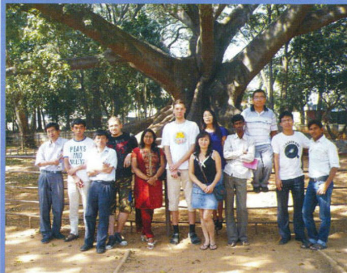
Space Science 7 Group at Lalbaug ,Bengaluru