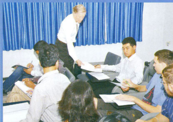
Late Prof. Tom Gehrels

For astronomy and Solar Observations, two dedicated Observatories, one operating in Infra-red and other in visual bands are there at Mount Abu and Udaipur, respectively. An ambitious research plan for the next five years has been drawn up and Space based experiments in Astronomy, Atmospheric and Planetary sciences are proposed. Computer facilities include a number of high power workstations with a large number of PCs connected through network with connectivity to Internet. PRL hosts an excellent library with a large collection of books and periodicals in varied fields of Space and Atmospheric Sciences.