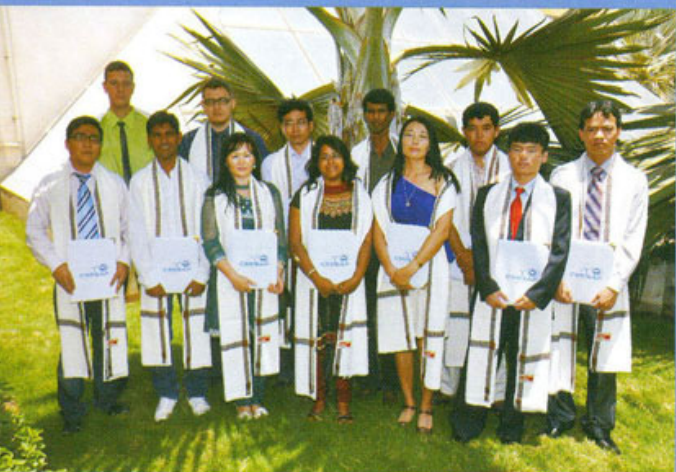
Space science 7 participants with diploma

The Centre is in agreement with Andhra University (est. 1926) Vishakhapatnam, India for award of M. Tech. Degree. The terms and conditions of this agreement are reviewed from time to time. A few meritorious students of P.G. Course are also considered for award of additional fellowship of six months to one year to complete part of their research work at Centre's host institutions in India which may lead to a M. Tech. Degree of Andhra University.