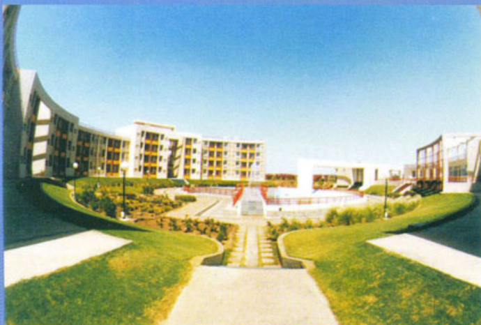
International Hostel Campus