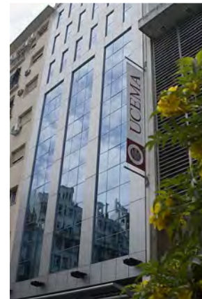
UCEMA building of Reconquista 775, located in downtown Buenos Aires, at the heart of the financial and cultural activity of the country