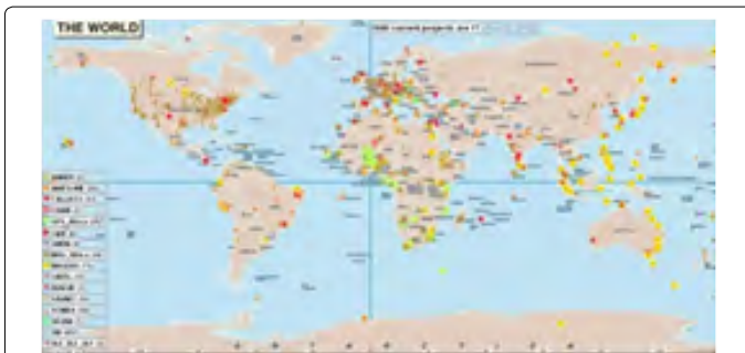
Figure 1: The Figure illustrates the worldwide current distribution of space weather instrument arrays in operation.

A series of workshops on basic space science was held from 1991 to 2004 (India 1991, Costa Rica and Colombia 1992, Nigeria 1993, Egypt 1994, Sri Lanka 1995, Germany 1996, Honduras 1997, Jordan 1999, France 2000, Mauritius 2001, Argentina 2002, and China 2004;