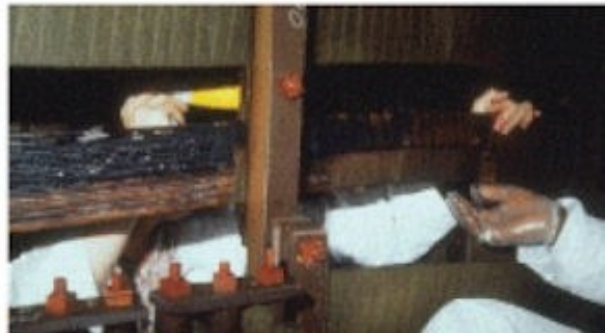
Permanent damage to the Salem New Jersey Nuclear Plant GSU Transformer caused by the severe geomagnetic storm of 13 March 1989

"Space weather is a significant natural hazard that requires global preparedness," says Prof. Hans Haubold of the UN Office for Outer Space Affairs. "This new agenda item links space science and space technology for the benefit of all humankind."