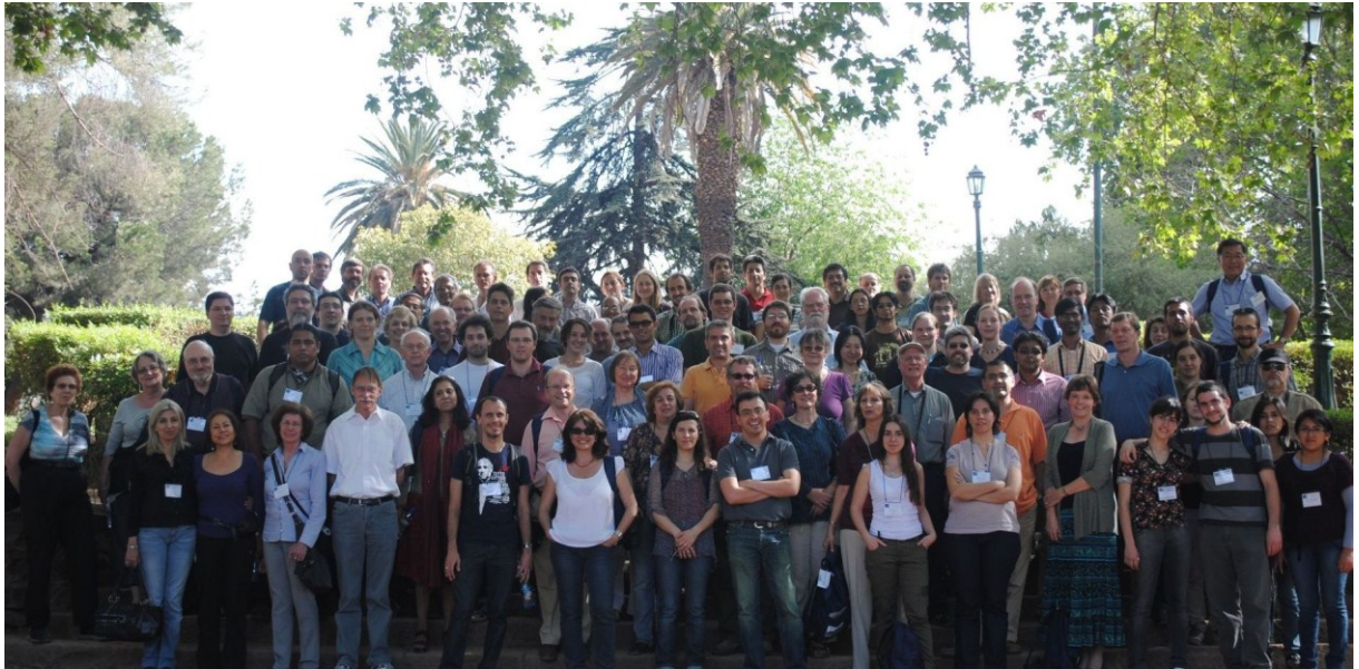
IAUS 286 participants in San Martín Park, Mendoza