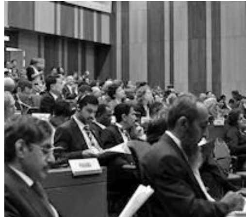
The UN Committee on the Peaceful Uses of Outer Space (UNCOPUOS)

Space (COPUOS). COPUOS became a forum for development of laws and treaties governing space-related activities. Moreover, it set the stage for international cooperation on problems that no one nation could handle alone.