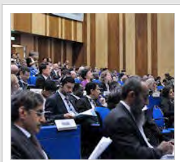
The UN Committee on the Peaceful Uses of Outer Space (UNCOPUOS).

This week, members of the Science and Technical Subcommittee heard about some of the potential economic impacts of space weather. For instance, modern oil and gas drilling frequently involve directional drilling to tap oil and gas reservoirs deep in the Earth. This drilling technique depends on accurate positioning using global navigation systems. Drill heads could go awry, however, if the sun interferes with GPS reception. Solar energetic particles at the magnetic poles can force the re-routing of international airline flights resulting in delays and increased fuel consumption. Ground induced currents generated by magnetic storms can damage transformers and increase corrosion in critical energy pipelines.