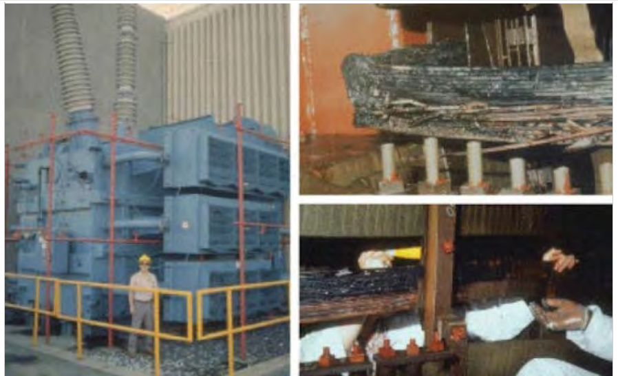
Permanent damage to the Salem New Jersey Nuclear Plant GSU Transformer caused by the severe geomagnetic storm of March 13, 1989. More

"Space weather is a significant natural hazard that requires global preparedness," says Prof. Hans Haubold of the UN Office for Outer Space Affairs. "This new agenda item links space science and space technology for the benefit of all humankind."