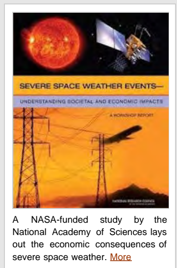
A NASA-funded study by the National Academy of Sciences lays out the economic consequences of severe space weather. More