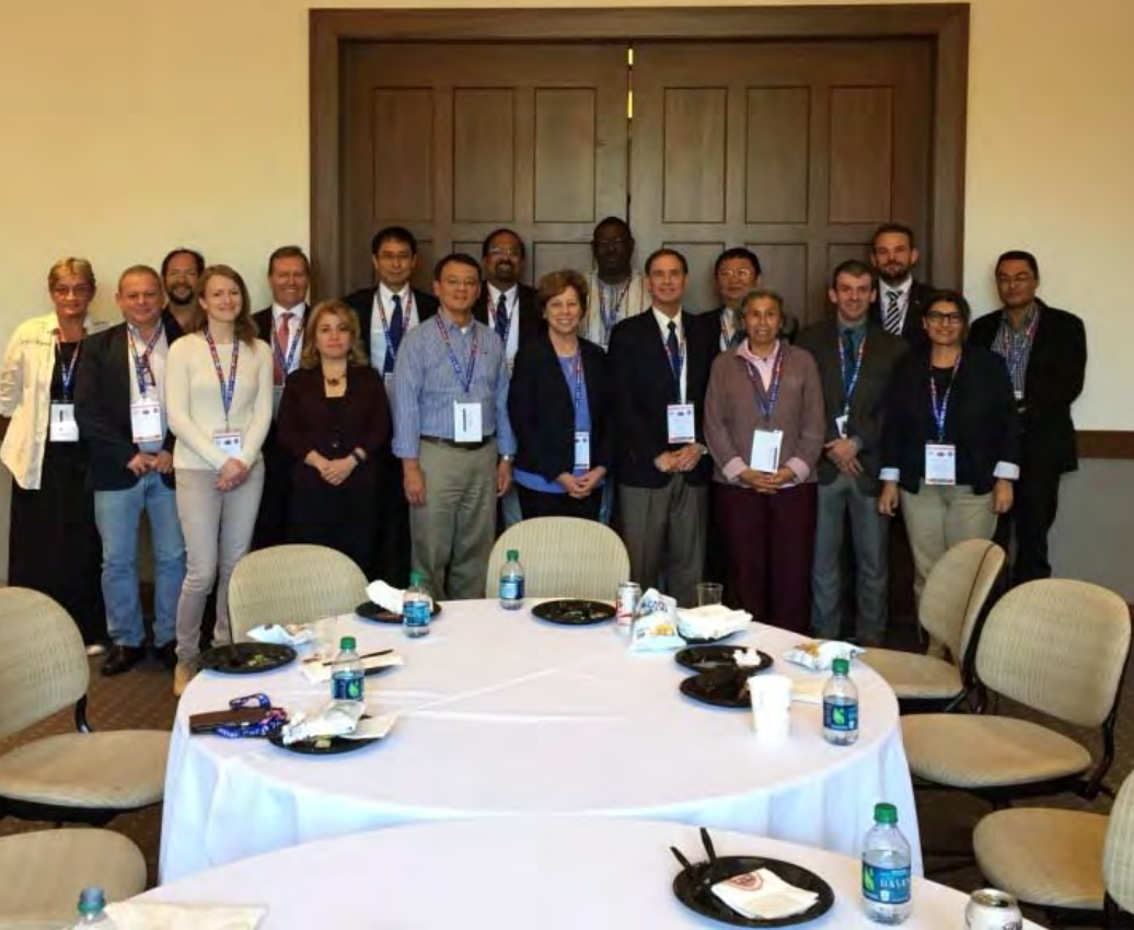
The Scientific Organizing Committee