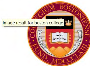
Image result for boston college