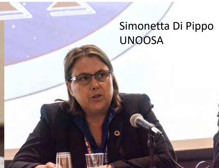
Simonetta Di Pippo UNOOSA