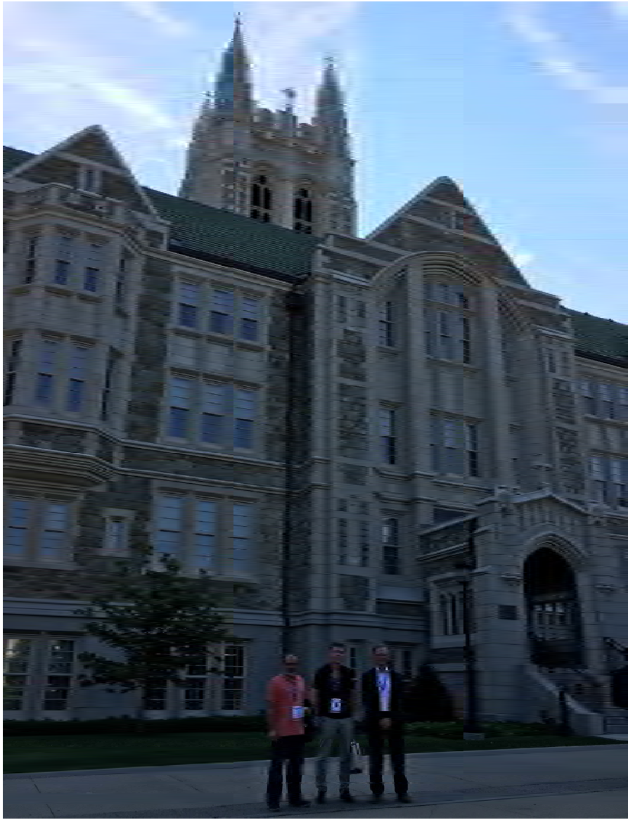
WELCOME RECEPTION The Gasson Hall