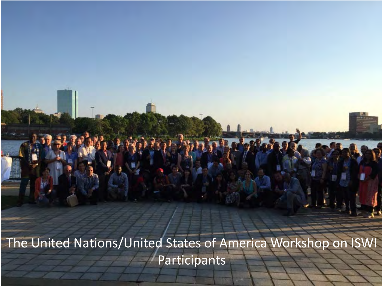
The United Nations/United States of America Workshop on ISWI Participants